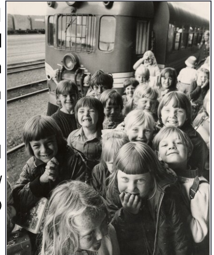
Students of Briggston School on a field trip in 1977