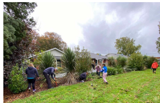
Birdsong Trail Planting Day