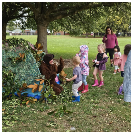
Walking Festival Bear Hunt