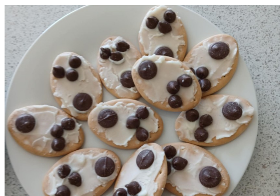
Sparkling Stars Easter Party